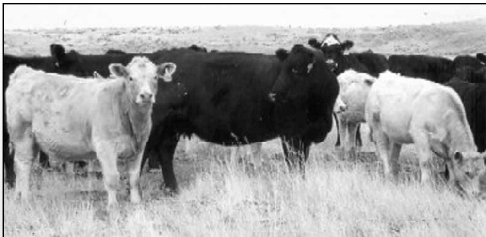
FEEDER HEIFERS OFF STOCKERS OCT. 2007