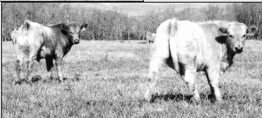
WEISNER RANCH, AUGUST, MT